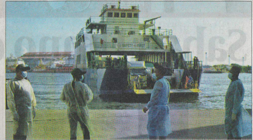
Covid-19 check: Health officials on duty waiting for the arrival of passengers of a ferry from Menumbok in mainland Sabah at the Labuan International Ferry Terminal, Thursday. During the Conditional Movement Control Order (CMCO) period, every passenger arriving in Labuan will have to go through screening for coronavirus (Covid-19) to ensure the island remains as a green zone.

"Entertainment outlets in Labuan should be given some relaxation as the island has been declared a Covid-19 green zone," he said.