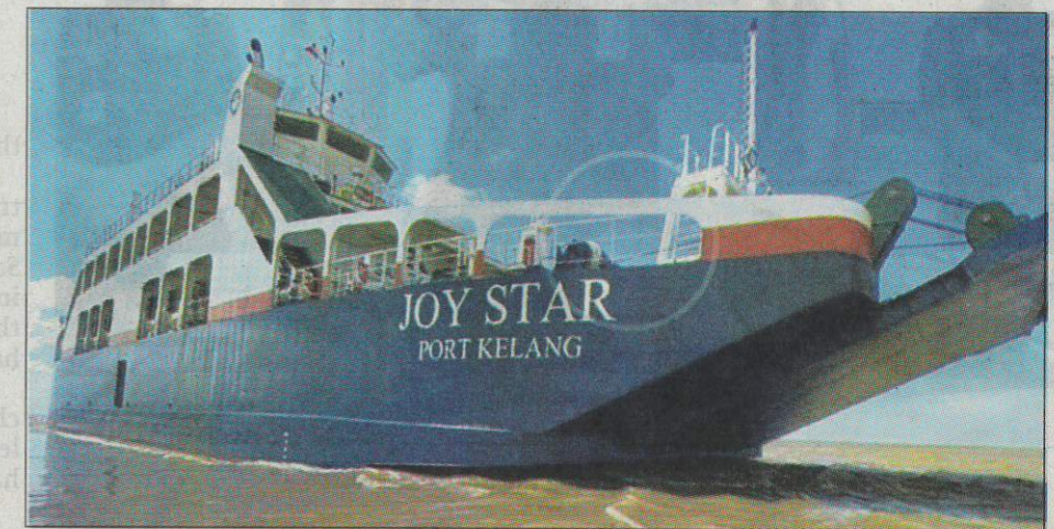
The Sarawak-built 'Joy Star'.

that when another vessel goes under maintenance there would be enough vessels to serve.